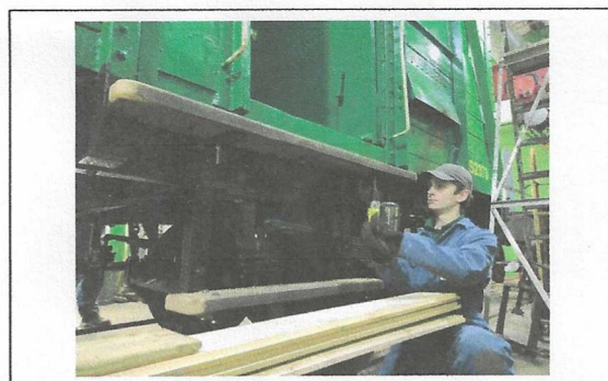
Fixing the steps to the waggon