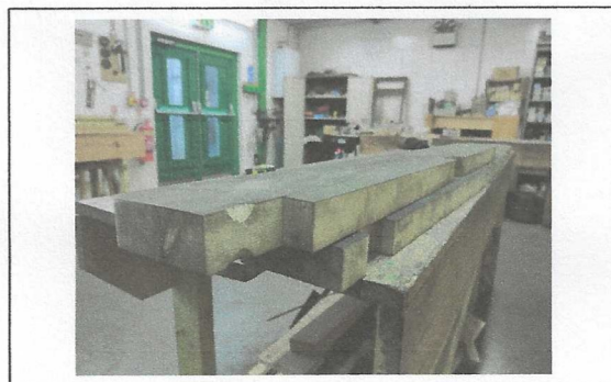
Notches and cut-outs