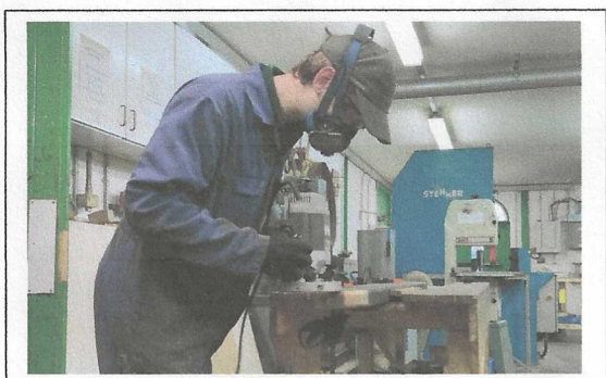
Cut Half round edge with a router